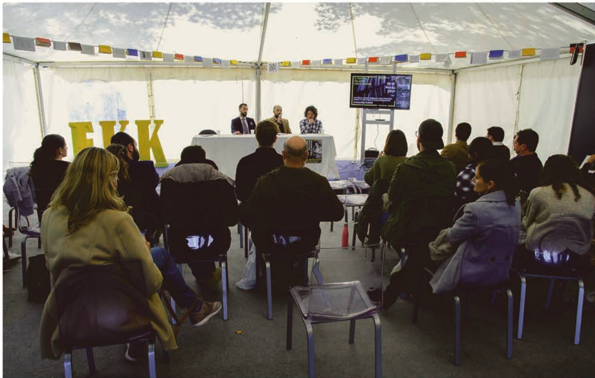
▲ One of the events organized in the fully-equipped activity area inside the Campus Book Festival 2019 tent. This is set up right at the heart of Campus in the University Quadrangle.

The sixth edition of the increasingly popular Campus Book Festival was held on the University Quad from 27–29 March 2019. It was a collaborative effort of the National Book Council and Għaqda tal-Malti – Università