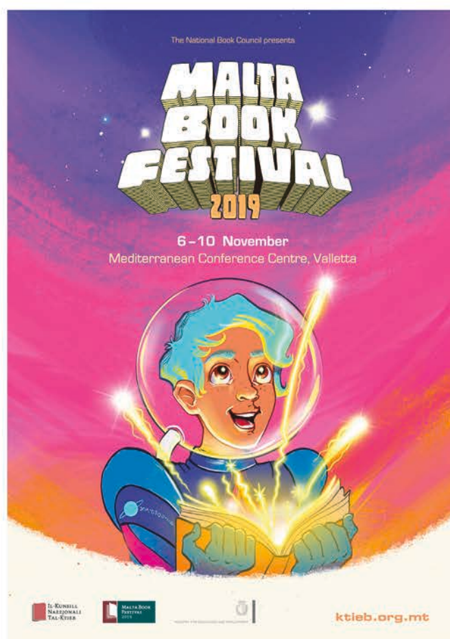
▲ The poster of the Malta Book Festival 2019 was illustrated by Lisa Falzon, with graphic design by Steven Scicluna.

For the first time, a daily free shuttle service sponsored and operated by Malta Public Transport was available for the public.